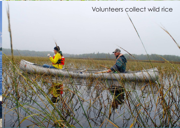
Volunteers collect wild rice