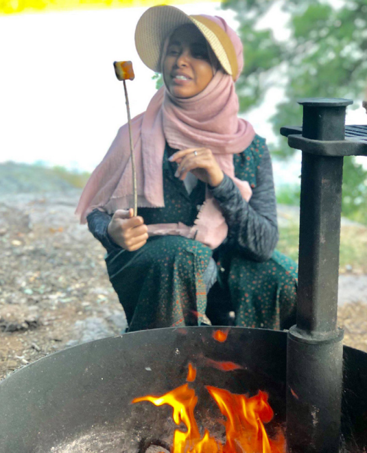
2018 Teen Ambassador

VNPA provided support for a new paddle launching dock at the Rainy Lake Visitor Center and a camping reservation kiosk at Crane Lake, and engaged volunteers to work on clearing the Kab-Ash Trail. VNPA also provided funding for visitor education resources like new signage at Anderson Bay and Oveson Fish Camp.